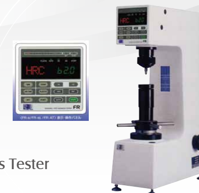
硬度機 Hardness Tester