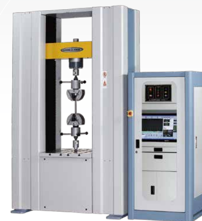
拉力機 20 Ton Micro Computer Universal Tester