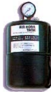
YML-605 YANKEE HORN TANK SIZE:210Lx125Wx125H mm 2.0L