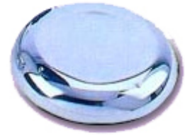
YML-603 HORN COVER SIZE: 170x32 / 197x32