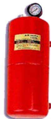
YML-606 YANKEE HORN TANK SIZE : (a)330x125x125 3.5L (b)500x125x125 5.6L