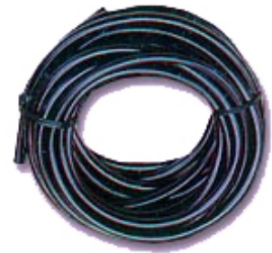
YML-608 High Pressure Nylon Air Tube HORN USE SIZE:6ø*450DL