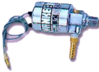
YS-302 HORN SWITCH 12/24V