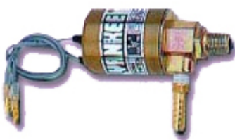
YS-303 HORN SWITCH 12/24V