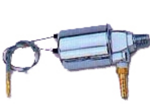
YS-301 HORN SWITCH 12/24V