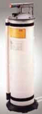
• CJ-169 Portable Extracting Equipment