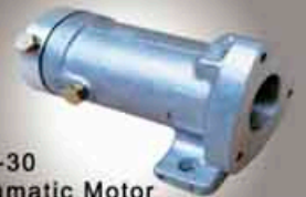
• AM-30 Pneumatic Motor