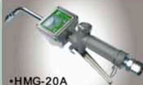
• HMG-20A Oil Gun with Digital Flow Meter