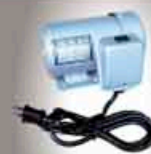
• AC-30 AC Electric Motor 110V