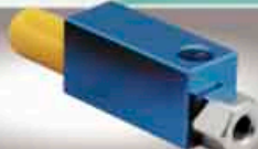
• HV-03 Vacuum Ejector : 1/4"PT