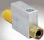
• HV-01 Vacuum Ejector 1/8"PT