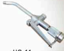
• HG-11 3/8" x 1/4"PT oil Gun