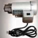
• AC-35 Electric Motor Pump