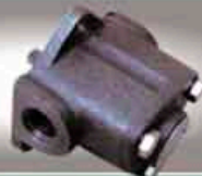
• AP-30 Pump 3/8"