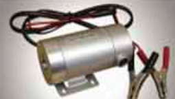
• DC-30 DC Pump 12V