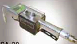
• SA-20 Fixed Amount Filling Gun includes Digital Flow Meter