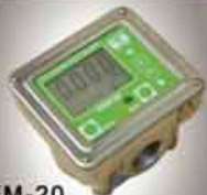
• HEM-20 Digital Flow Meter