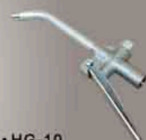
• HG-10 3/8" x 1/4"PT oil Gun