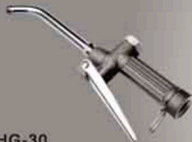
• HG-30 1/2" x 1/4"PT Oil Gun