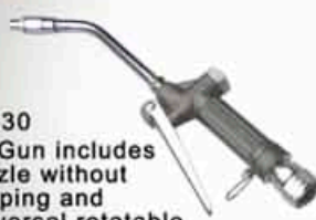
• HG-30 Oil Gun includes nozzle without dripping and Universal rotatable connector