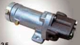
• AP-35 Pneumatic Motor Pump