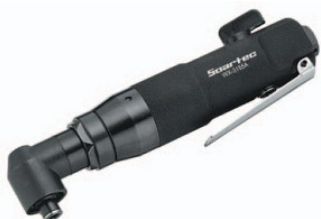
WX-3155A Two Hammer