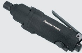
WS-302 Two Hammer