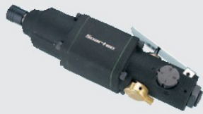
WS-301 / 301J / 301P Two Hammer / Jumbo Hammer / Pin Less