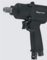
WS-305 / 305J / 305P Two Hammer / Jumbo Hammer / Pin Less