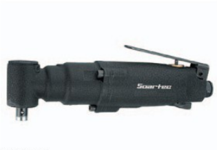
WS-304 1/4" Corner Screwdriver Two Hammer