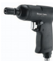
WX-325HP Two Hammer