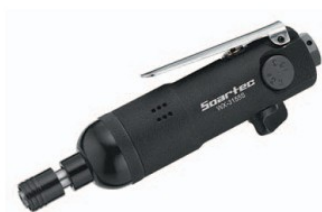
WX-3155S Two Hammer