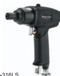
WX-316LS Two Hammer