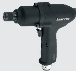
WS-303 Two Hammer