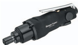
WX-318H Two Hammer