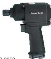
WS-2052 Twin Hammer

6 Position Power regulator : 3 settings in forward, 3 in reverse. 正、逆轉各3段位扭力調節。