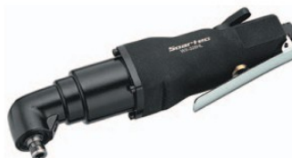
WX-328HL Two Hammer