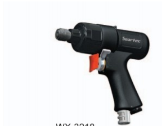
WX-3218 Twin Hammer