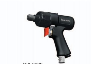
WX-3208 Two Hammer