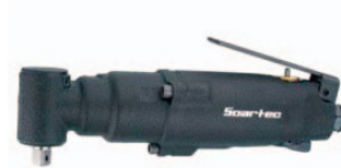
WS-304W 3/8" Corner Impact Driver Two Hammer