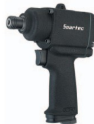
WS-2057 Two Hammer-for soft joint of work