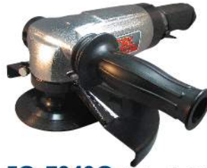
TG-7049G :9" Angle Grinder TG-7049L :With Lever Type