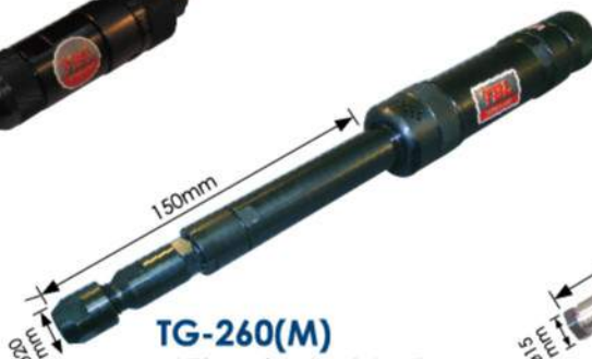
TG-260(M) 1/4" (6mm) Industrial Roll Type Throttle Extended Air Die Grinder TG-260L(M) With Lever Type Throttle