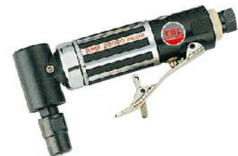
TG-7136(M) 0.3Hp 1/4" (6mm) Air Angle Die Grinder