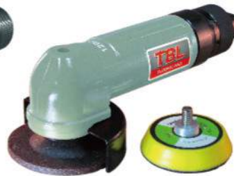
TG-2KG 2" Angle Grinder/Sander TG-2KL : With Lever Type Throttle