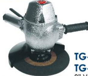
TG-7092 TG-7093 9" Vertical Grinder