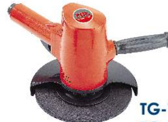
TG-7080 TG-7090 7"/9" Vertical Grinder