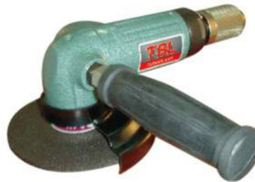
TG-5G 5" Angle Grinder TG-5L : With Lever Type Throttle