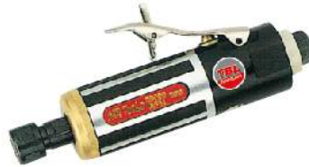
TG-7131(M) 0.6Hp 1/4" (6mm) Air Die Grinder