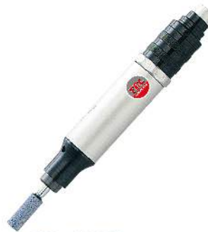
TG-3150 0.01Hp Micro Grinder (40,000 Rpm)