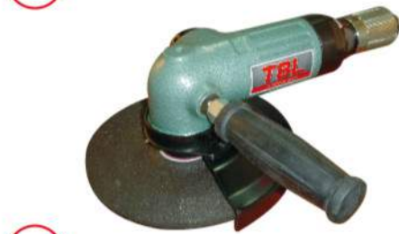
TG-7G 7" Angle Grinder TG-7L : With Lever Type Throttle