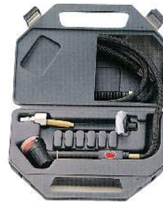
TG-3190 30 mm 120° Roll Throttle Type Micro Grinder (22,000 Rpm)