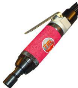
TG-251 TG-251(F) (Front Exhaust) Industrial Lever Type Grinder (20,000 Rpm)