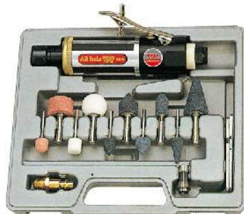
TG-7130(M)K TG-7131(F)(M)K TG-7132(M)K 1 Pc Grinder 1 Pc Collect 2 Pcs Wrench 10 Pcs Grinding Stone