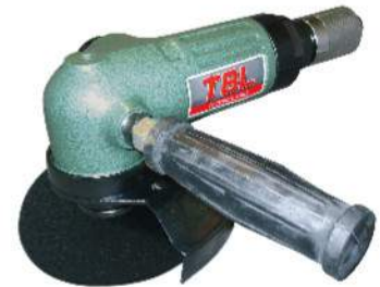
TG-6AG 6" Angle Grinder TG-6AL : With Lever Type Throttle