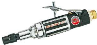
TG-7133(M) TG-7133F(M) (Front Exhaust) 0.3Hp 1/4" (6mm) Air Die Grinder With 1" Extended Type