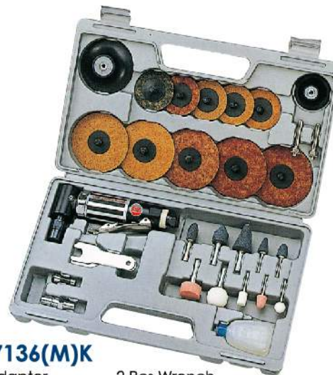
TG-7136(M)K 1 Pc Adapter 1 Pc TG-7136 (M) 1 Pc Oil Pot 1 Pc 2" Rubber Pad 1 Pc 3" Rubber Pad 2 Pcs Wrench 2 Pcs Linkage Rod 5 Pcs 2" Mon-Woven Sading Paper 5 Pcs 3" Mon-Woven Sading Paper Packing: 10/Ctn/17/1.6'