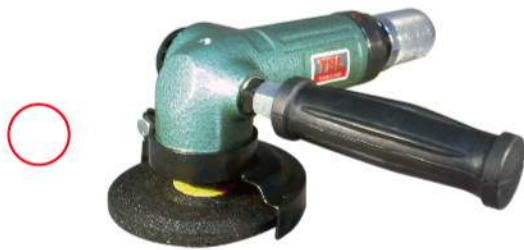
TG-4G 4" Angle Grinder TG-4L : With Lever Type Throttle