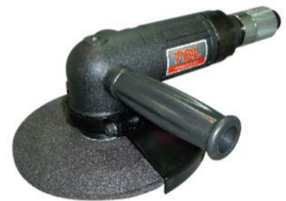
TG-9G 9" Angle Grinder TG-9L : With Lever Type Throttle