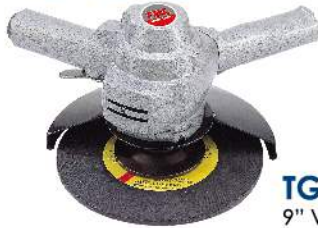
TG-7091 9" Vertical Grinder