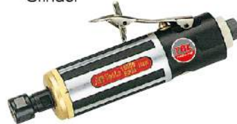
TG-7132 (M) 0.9Hp 1/4" (6mm) Air Die Grinder