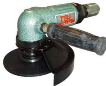
TG-70G 3 IN 1 Angle Grinder/Sander/Wire Brush TG-70L : With Lever Type Throttle