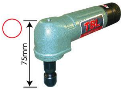
TG-20G(M) 1/4"(6mm) Angle Die Grinder TG-20L : With Lever Type Throttle