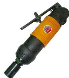
TG-38N(S) TG-38NL (Extention) Industrial Lever (Roll) Throttle Type Air Grinder