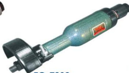
TG-7082 3" Industrial Horizontal Grinder TG-7082L With Lever Type Throttle