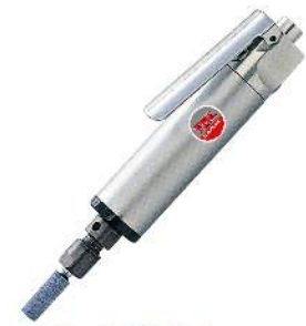
TG-G38(N) 0.38Hp Micro Grinder (25,000 Rpm)