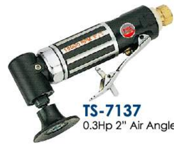
TS-7137 0.3Hp 2" Air Angle Sander