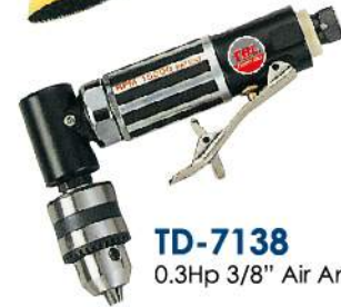
TD-7138 0.3Hp 3/8" Air Angle Drill