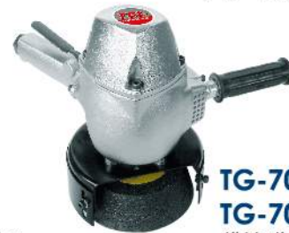
TG-7094 TG-7095 6" Vertical Grinder