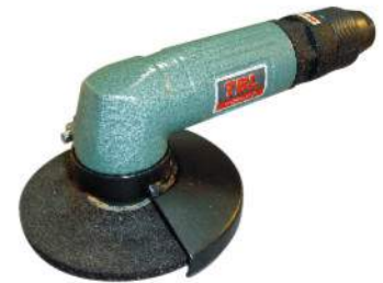
TG-4MG 4" Mini Angle Grinder TG-4ML : With Lever Type Throttle