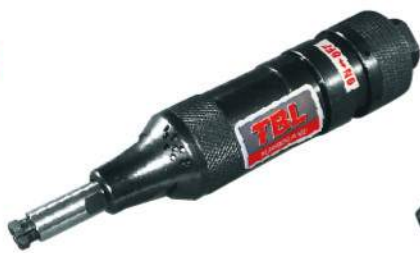
TG-13(M) 1/8" (3mm) Mini Roll Type Throttle Gringer TG-13L: Lever Type Throttle