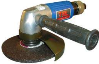
TG-7303 0.5HP 5" Angle Grinder TG-7303L With Lever Type Throttle