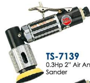
TS-7139 0.3Hp 2" Air Angle Orbital Sander