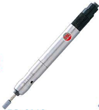
TG-3160 0.01Hp Micro Grinder (65,000 Rpm)