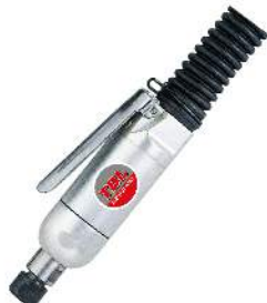
TG-250(G) Industrial Lever (Roll) Throttle Type Grinder (25,000 Rpm)