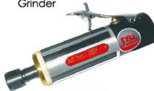
TG-7132F(M) 0.9Hp 1/4" (6mm) Air Die Grinder (Front Exhaust)