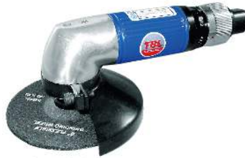
TG-7301 0.35Hp 4" Mini Angle Grinder TG-7301L With Lever Type Throttle