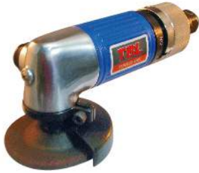
TG-7300 0.25Hp 2" Angle Grinder TG-7300L With Lever Type Throttle