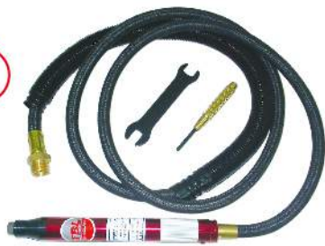
TG-3170 Roll Throttle Type Micro Grinder (54,000 Rpm)