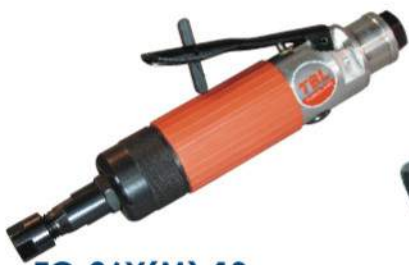
TG-26X(M)-1S 1/4" (6MM) Die Grinder With Silent Hose TG-26X(M)-1F Without Silent Hose