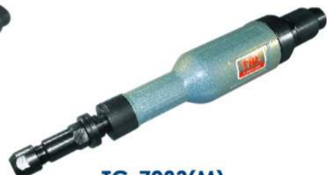
TG-7083(M) 1/4" (6mm) Industrial Horizontal Grinder TG-7083L(M) With Lever Type Throttle