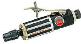
TG-7130(M) 0.3Hp 1/4" (6mm) Mini Air Die Grinder