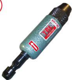
TG-7309(M) TG-7309L(M) Industrial Roll (Lever) Throttle Type Grinder (22,000 Rpm)