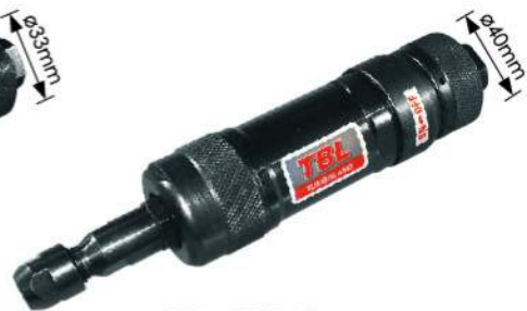
TG-50(M) 1/4" (6mm) Roll Type Throttle Gringer TG-50L: Lever Type Throttle