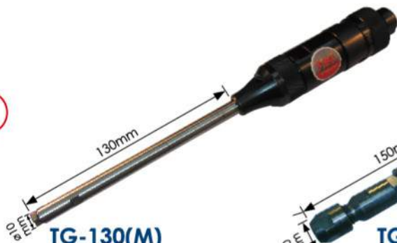
TG-130(M) 1/8" (3mm) Mini Roll Type Throttle Extended 5" Die Grinder TG-130L(M) With Lever Type Throttle