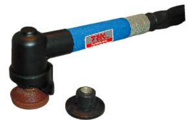
TG-3192 30MM Mini 90° Degree Angle Grinder & Sander