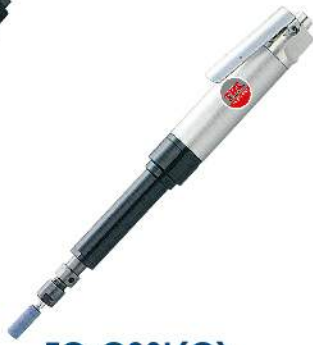
TG-G38L(G) 0.38Hp Extension Micro Grinder (25,000 Rpm)