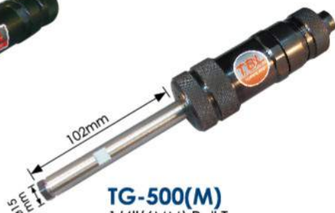
TG-500(M) 1/4" (6MM) Roll Type Throttle Extended 3" Die Grinder TG-500L(M) With Lever Type Throttle