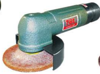
TG-2G 2" Angle Grinder TG-2L : With Lever Type Throttle