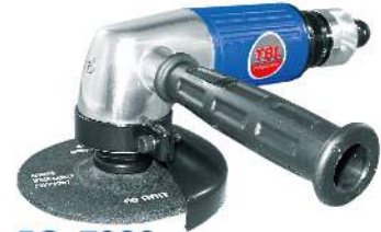
TG-7302 0.36Hp 4" Angle Grinder TG-7302L With Lever Type Throttle