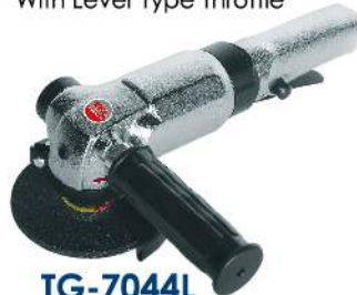
TG-7044L 4" Angle Grinder TG-7044G With Roll Type Throttle