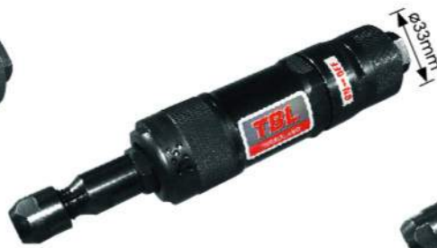
TG-26(M) 1/4" (6mm) Medium Roll Type Throttle Gringer TG-26L: Lever Type Throttle