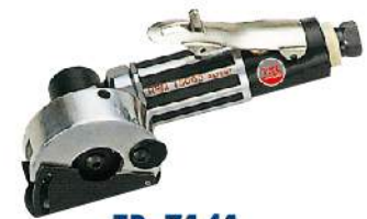
TB-7141 0.3Hp 2" Air Cutting Saw