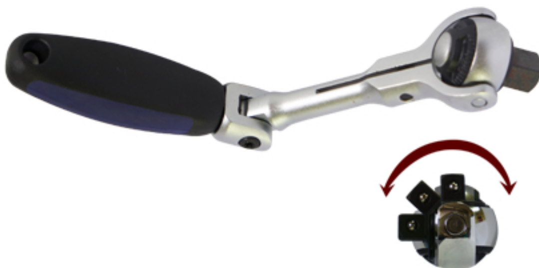
Flexible roto ratchet