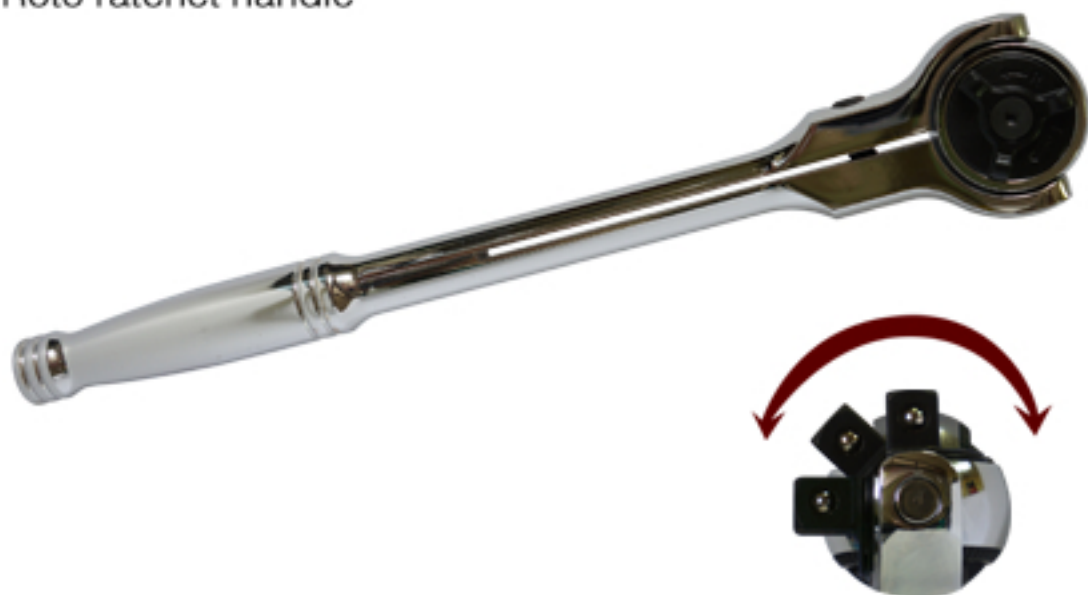
Roto ratchet handle