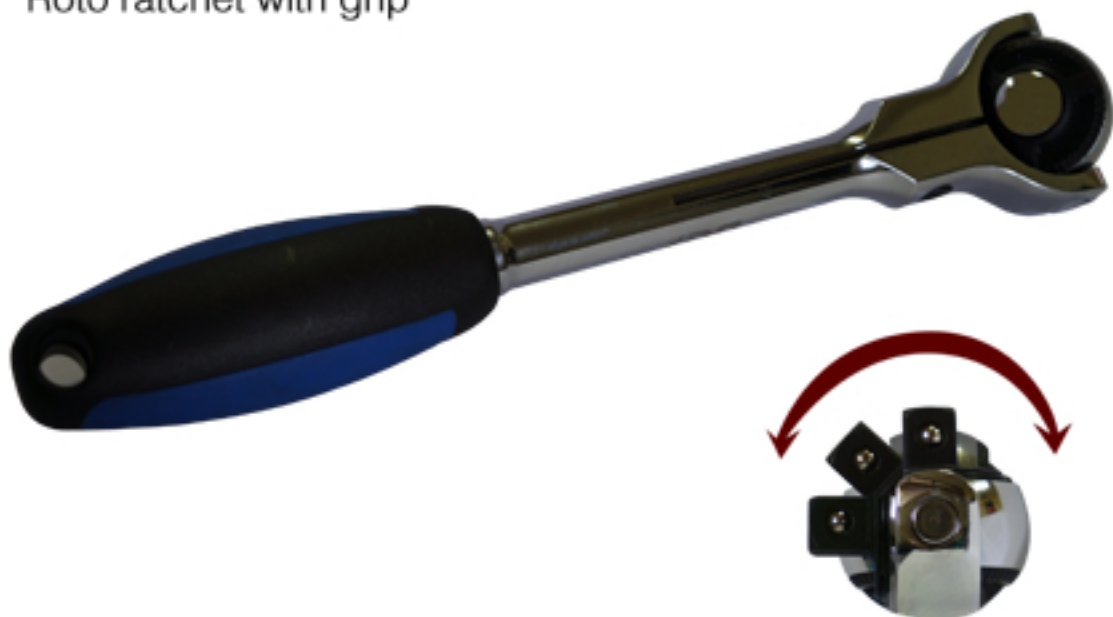
Roto ratchet with grip