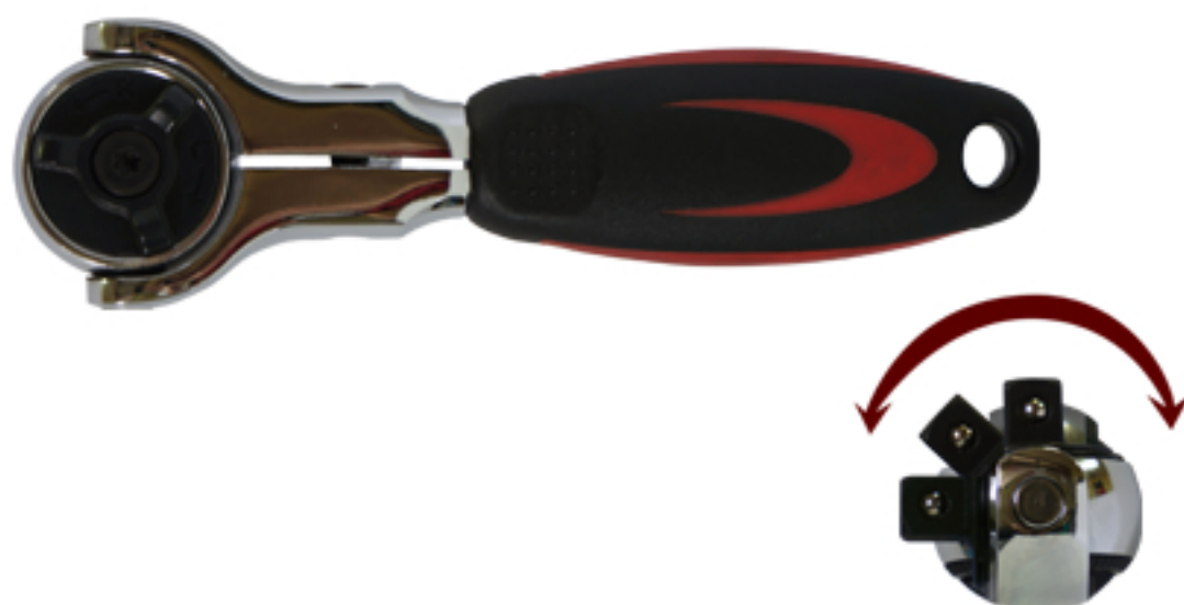
Stubby roto ratchet