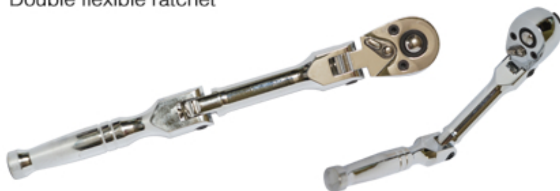
Double flexible ratchet