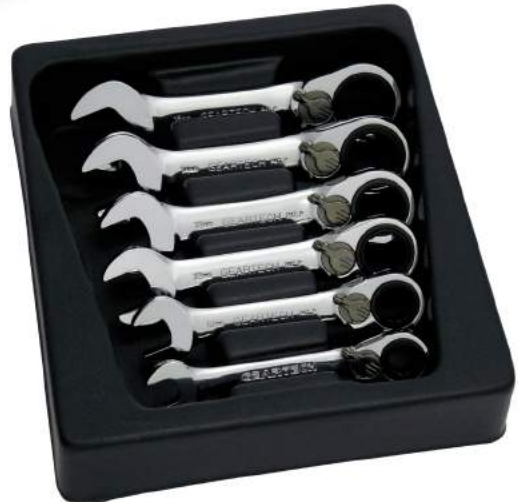
6x Reversible Geartech® Stubby Combination Wrench Set