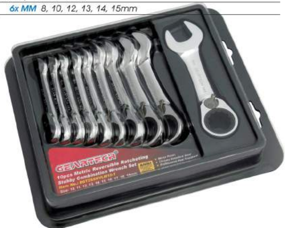
10x Reversible Geartech® Stubby Combination Wrench Set