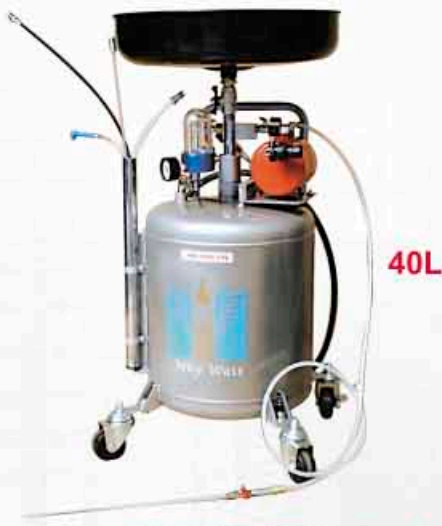
• HD-408WN(Oil loading Cup) • HD-408W