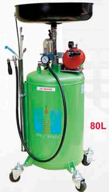
• HD-808WN(Oil loading Cup) • HD-808W