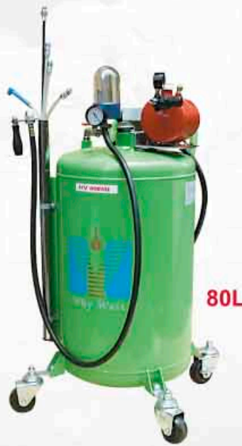
• HV-808WN(Oil loading Cup) • HV-808W • HV-408W • HV-408WN