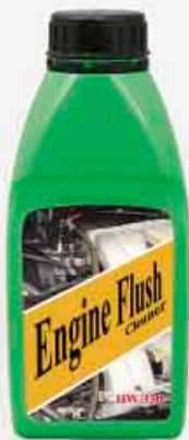
• HW-350 Engine Flushing Cleaner 350ml