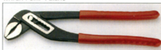
WATER PUMP PLIERS