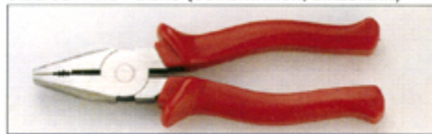
SIDE CUTTING PLIERS (COMBINATION, LINESMAN)