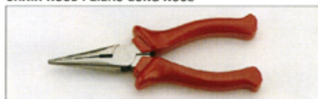
CHAIN NOSE PLIERS LONG NOSE