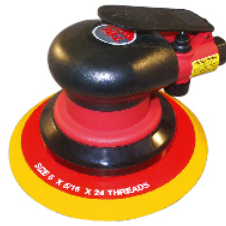
TS-7063(V)(VC) Composite Air Random Orbital Sander With 5"/6" Pad (10,000 Rpm)