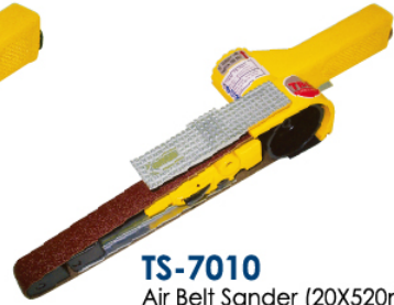
TS-7010 Air Belt Sander (20X520mm) TS-7010P (Rubber Pulley) Air Belt Sander (20X520mm)