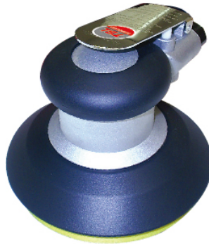
Self-Generated Vacuum Type