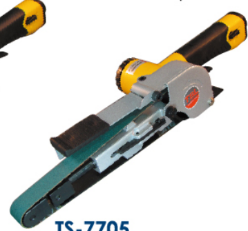
TS-7705 Air Belt Sander (20X520mm) TS-7705P (Rubber Pulley) Air Belt Sander (20X520mm)