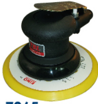
TS-7065 H/D Random Orbital Sander