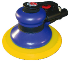
TS-7062(V) Composite Air Random Orbital Sander With 3"/5"/6" Pad (10,000 Rpm)