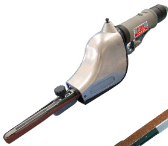
TS-7000 Air Belt Sander (13X610mm)