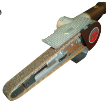
TS-7713 Air Belt Sander With Coated Abrasive Sheets(20x520mm)