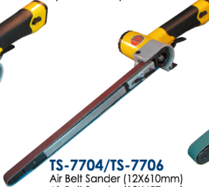
TS-7704/TS-7706 Air Belt Sander (12X610mm) Air Belt Sander (12X457mm)