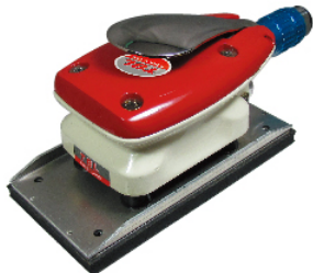
TS-7111(V) Air Jittbug Orbital Sander (73X91mm) (9,000Rpm)