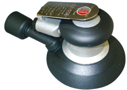
Central Vacuum Type