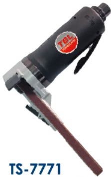
TS-7771 Angle Belt Sander (10X330mm)