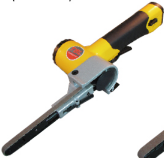
TS-7702 Heavy Duty Air Belt Sander(6x330mm)