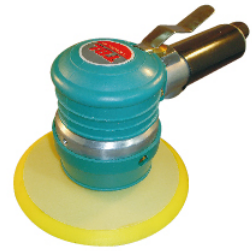
TS-7023(V)(VC) Air Random Orbital Sander With 5"/6" Pad(10,000 Rpm) Orbit Dia.:10.0 mm