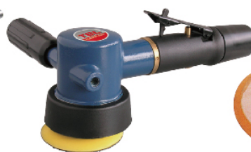
TS-7746 Air Random Orbital Sander With 3"/5" Pad (11,000Rpm)