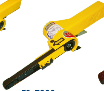
TS-7009 Air Belt Sander (10 X 330 mm)