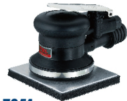
TS-7051 H/D Jitterbug Sander(100X110mm)