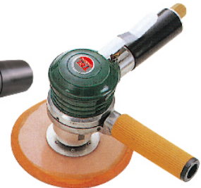
TS-7021 Gear Driven Air Sander With 5"/6" Pad (2,700 Rpm)