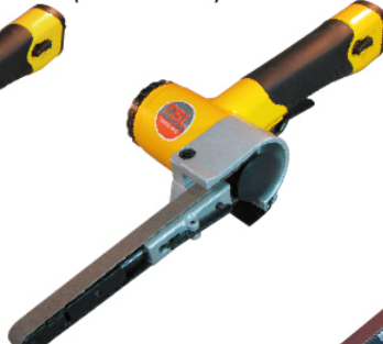
TS-7703 Heavy Duty Air Belt Sander(10x330mm)