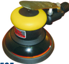
TS-7050F H/D Oil Free Random Orbital Sander