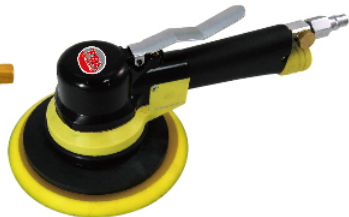
TS-7937(V) Air Random Orbital Sander With 5"/6" Pad(10,000 Rpm) Orbit Dia.:7.0 mm