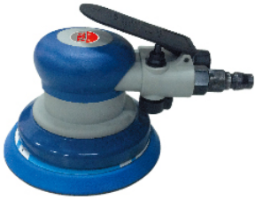
TS-7061(V)(VC) Air Random Orbital Sander With 5"/6" Pad (10,000 Rpm)