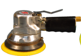
TS-7728(V)(VC) Air Random Orbital Sander With 5"/6" Pad (10,000 Rpm) Orbit Dia.:7.0 mm