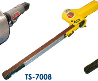
TS-7008 Air Belt Sander (13 X 610 mm)