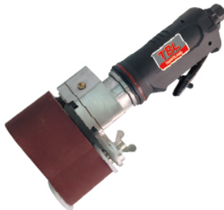
TS-7719 Air Belt Sander (50X235mm)