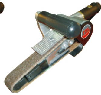
TS-7001 Air Belt Sander With Coated Abrasive Sheets(30x540mm)