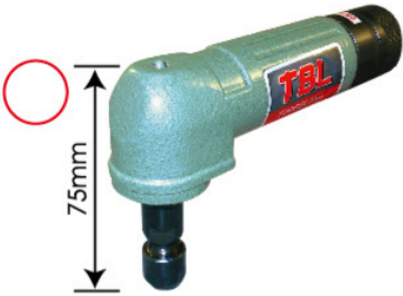
TG-20G(M) 1/4" (6mm) Angle Die Grinder TG-20L : With Lever Type Throttle