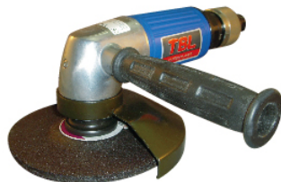
TG-7303 0.5HP 5" Angle Grinder TG-7303L With Lever Type Throttle