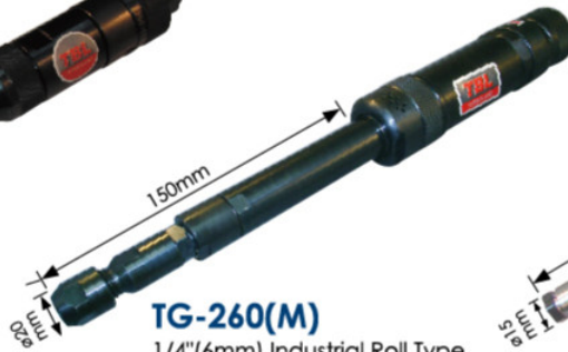
TG-260(M) 1/4" (6mm) Industrial Roll Type Throttle Extended Air Die Grinder TG-260L(M) With Lever Type Throttle