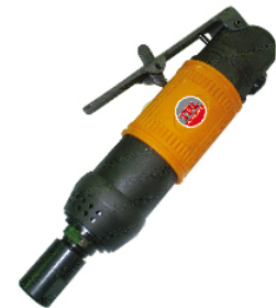
TG-38N(S) TG-38NL (Extension) Industrial Lever (Roll) Throttle Type Air Grinder