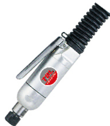
TG-250(G) Industrial Lever (Roll) Throttle Type Grinder (25,000 Rpm)