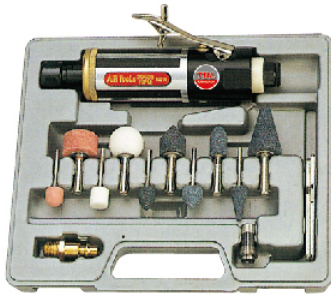
TG-7130(M)K TG-7131(F)(M)K TG-7132(M)K 1 Pc Grinder 1 Pc Collect 2 Pcs Wrench 10 Pcs Grinding Stone