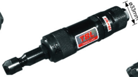
TG-26(M) 1/4" (6mm) Medium Roll Type Throttle Gringer TG-26L: Lever Type Throttle