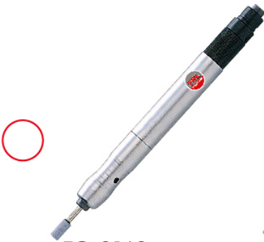
TG-3160 0.01Hp Micro Grinder (65,000 Rpm)