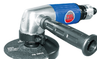
TG-7302 0.36Hp 4" Angle Grinder TG-7302L With Lever Type Throttle