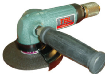
TG-5G 5" Angle Grinder TG-5L : With Lever Type Throttle