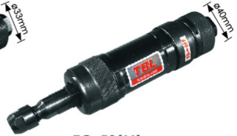
TG-50(M) 1/4" (6mm) Roll Type Throttle Gringer TG-50L: Lever Type Throttle