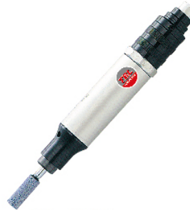
TG-3150 0.01Hp Micro Grinder (40,000 Rpm)