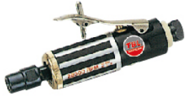
TG-7130(M) 0.3Hp 1/4" (6mm) Mini Air Die Grinder