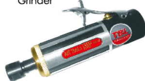
TG-7132F(M) 0.9Hp 1/4" (6mm) Air Die Grinder (Front Exhaust)