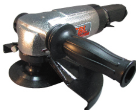
TG-7049G :9" Angle Grinder TG-7049L :With Lever Type