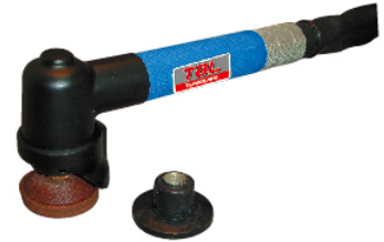
TG-3192 30MM Mini 90° Degree Angle Grinder & Sander