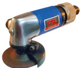
TG-7300 0.25Hp 2" Angle Grinder TG-7300L With Lever Type Throttle