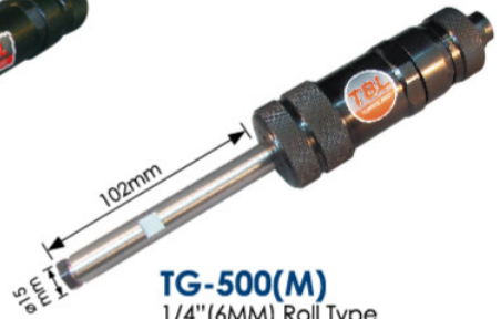
TG-500(M) 1/4" (6mm) Roll Type Throttle Extended 3" Die Grinder TG-500L(M) With Lever Type Throttle