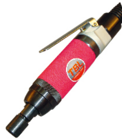
TG-251 TG-251(F) (Front Exhaust) Industrial Lever Type Grinder (20,000 Rpm)