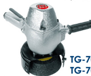
TG-7094 TG-7095 6" Vertical Grinder