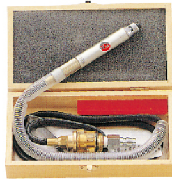
TG-3180 Roll Throttle Type Micro Grinder (70,000 Rpm)