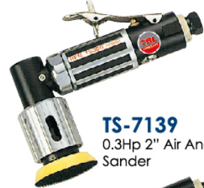
TS-7139 0.3Hp 2" Air Angle Orbital Sander