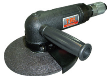
TG-9G 9" Angle Grinder TG-9L : With Lever Type Throttle