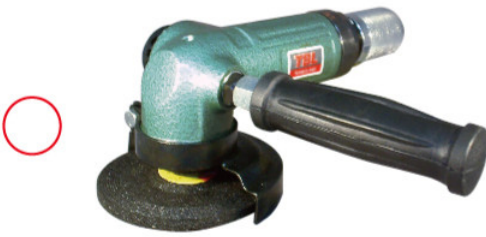
TG-4G 4" Angle Grinder TG-4L : With Lever Type Throttle