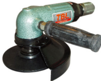
TG-70G 3 IN 1 Angle Grinder/Sander/Wire Brush TG-70L : With Lever Type Throttle