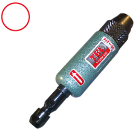
TG-7309(M) TG-7309L(M) Industrial Roll (Lever) Throttle Type Grinder (22,000 Rpm)