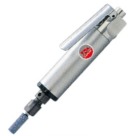
TG-G38(N) 0.38Hp Micro Grinder (25,000 Rpm)