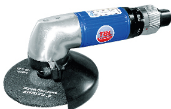
TG-7301 0.35Hp 4" Mini Angle Grinder TG-7301L With Lever Type Throttle