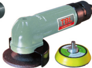
TG-2KG 2" Angle Grinder/Sander TG-2KL : With Lever Type Throttle