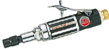
TG-7133(M) TG-7133F(M) (Front Exhaust) 0.3Hp 1/4" (6mm) Air Die Grinder With 1" Extended Type