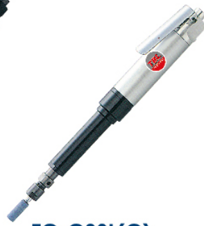
TG-G38L(G) 0.38Hp Extension Micro Grinder (25,000 Rpm)