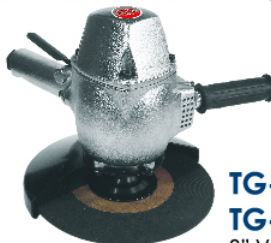
TG-7092 TG-7093 9" Vertical Grinder