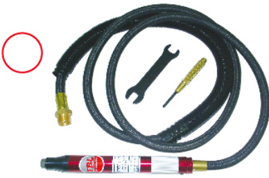
TG-3170 Roll Throttle Type Micro Grinder (54,000 Rpm)