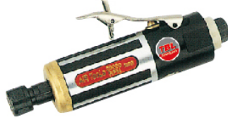
TG-7131(M) 0.6Hp 1/4" (6mm) Air Die Grinder