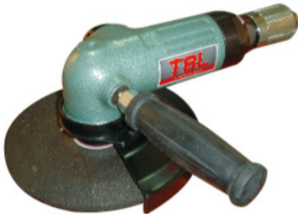
TG-7G 7" Angle Grinder TG-7L : With Lever Type Throttle