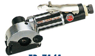
TB-7141 0.3Hp 2" Air Cutting Saw