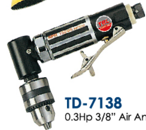
TD-7138 0.3Hp 3/8" Air Angle Drill