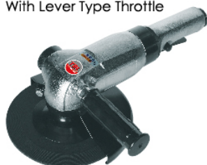
TG-7047L :7" Angle Grinder TG-7047G :With Roll Type Throttle