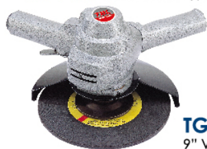
TG-7091 9" Vertical Grinder