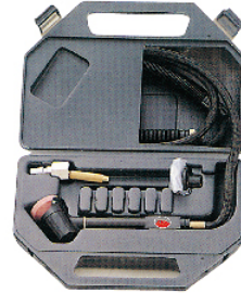
TG-3190 30 mm 120° Roll Throttle Type Micro Grinder (22,000 Rpm)