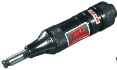
TG-13(M) 1/8" (3mm) Mini Roll Type Throttle Gringer TG-13L: Lever Type Throttle