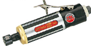
TG-7132 (M) 0.9Hp 1/4" (6mm) Air Die Grinder