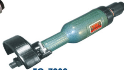
TG-7082 3" Industrial Horizontal Grinder TG-7082L With Lever Type Throttle