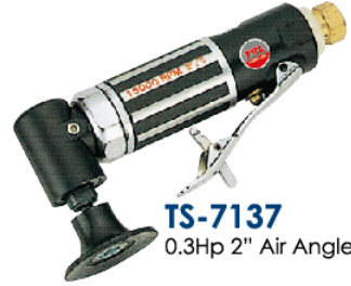
TS-7137 0.3Hp 2" Air Angle Sander