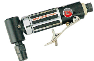
TG-7136(M) 0.3Hp 1/4" (6mm) Air Angle Die Grinder