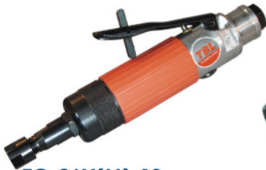
TG-26X(M)-1S 1/4" (6mm) Die Grinder With Silent Hose TG-26X(M)-1F Without Silent Hose