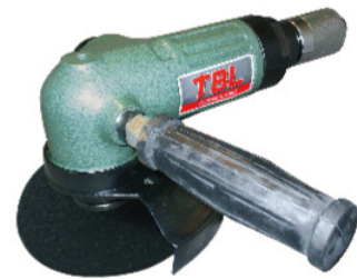
TG-6AG 6" Angle Grinder TG-6AL : With Lever Type Throttle