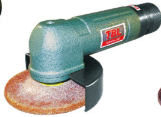
TG-2G 2" Angle Grinder TG-2L : With Lever Type Throttle