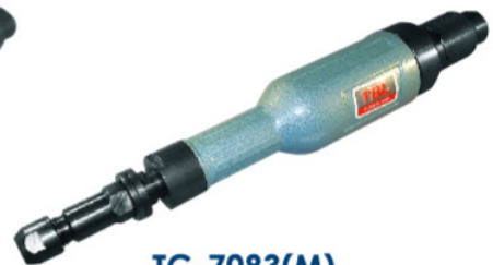
TG-7083(M) 1/4" (6mm) Industrial Horizontal Grinder TG-7083L(M) With Lever Type Throttle