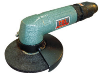
TG-4MG 4" Mini Angle Grinder TG-4ML : With Lever Type Throttle