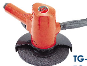
TG-7080 TG-7090 7"/9" Vertical Grinder