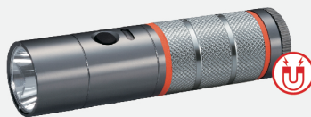
A32M 3W LED Flashlight