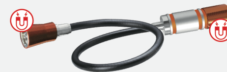
BI-L-CM01 Push LED Light