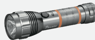
A52 3W LED Flashlight