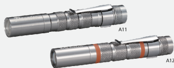
A11/A12 Mini Pocket Flashlight