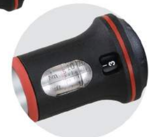
Dual Scale Windows Nm, ft/lbs