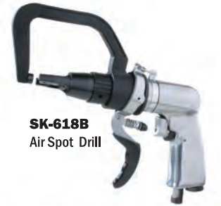
SK-618B Air Spot Drill