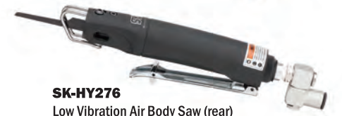
SK-HY276 Low Vibration Air Body Saw (rear)