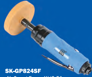
SK-GP824SF Air Smart Eraser W/3.5" eraser