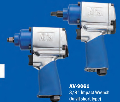
AV-9061 3/8" Impact Wrench (Anvil short type)