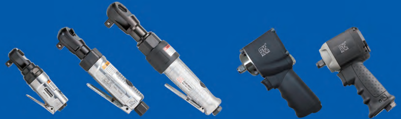
AV-1033S5W 3/8" Air palm ratchet wrench