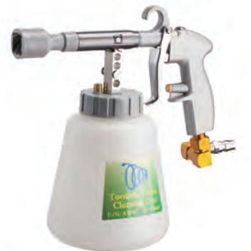
SK-AW512J Tornado Turbo Cleaning Gun