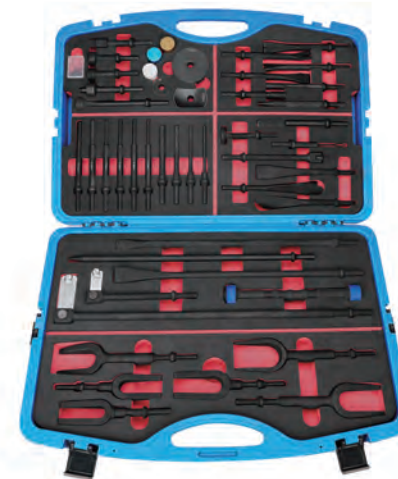
SK-5077 48 pcs Chisel Set