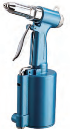
SK-AHR-101 3/16" Riveter