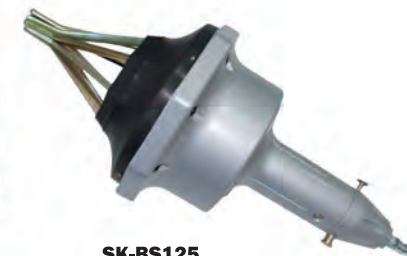
SK-BS125 Air Powered CV Boot Installation Tool