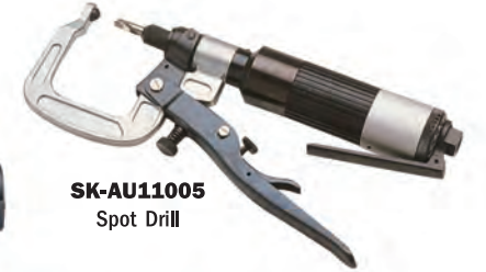
SK-AU11005 Spot Drill