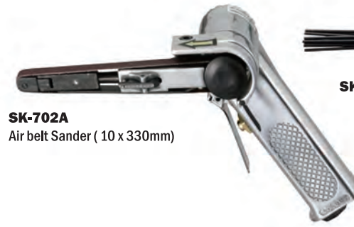
SK-702A Air belt Sander ( 10 x 330mm)