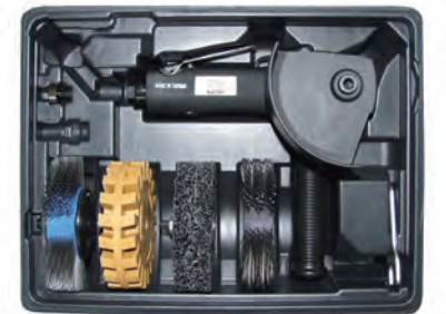
SK-15C0401 Rust & Raint Removal Tool