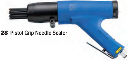
SK-JI28 Pistol Grip Needle Scaler