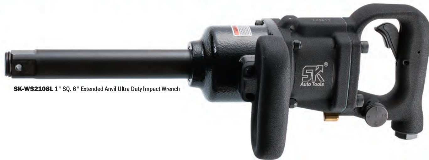
SK-WS2108L 1" SQ. 6" Extended Anvil Ultra Duty Impact Wrench