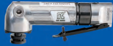
SK-9000 5" Angle grinder with Lever Throttle