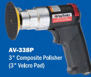
AV-338P 3" Composite Polisher (3" Velcro Pad)