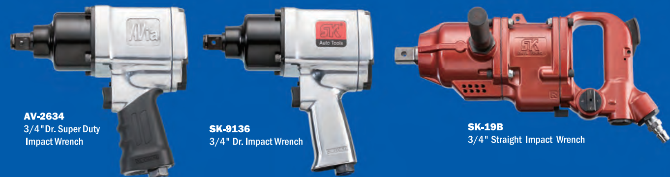
AV-2634 3/4" Dr. Super Duty Impact Wrench