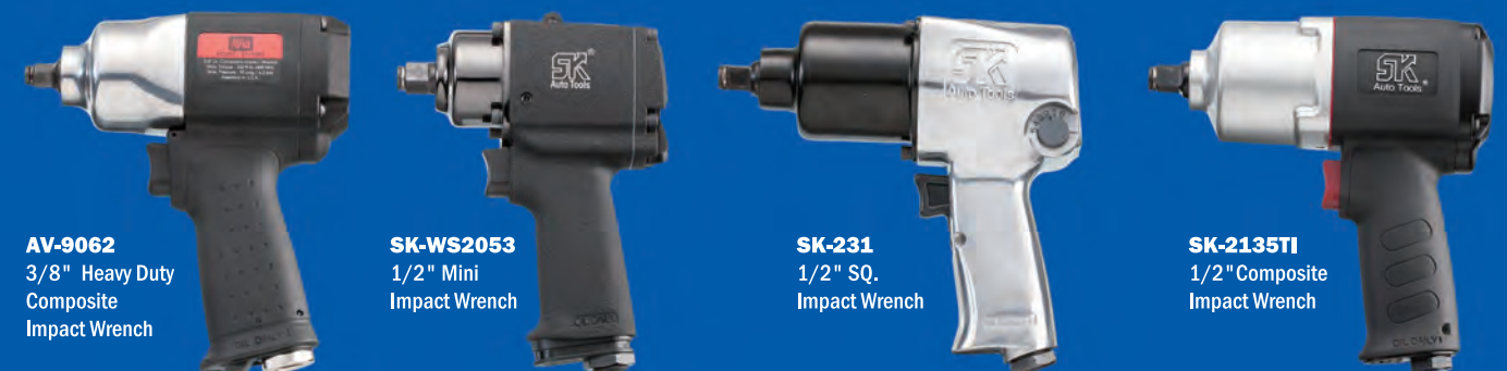
AV-9062 3/8" Heavy Duty Composite Impact Wrench