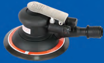
SK-WS105S-6HK Air Sander Kit 6"x 5mm Self-GEN. VAC., Hook Face