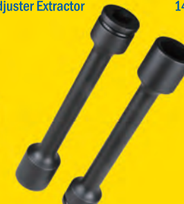
SK-9059 3/4" Sq. Dr. Extra Long Impact Sockets For Wheel Nuts