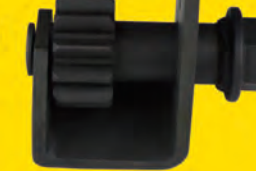
SK-9051C Engine Crank Alignment DAF