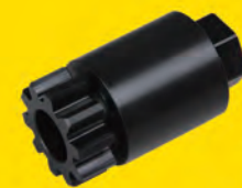
SK-9029K VOLVO (MP8/MP10) Flywheel Turning Tool