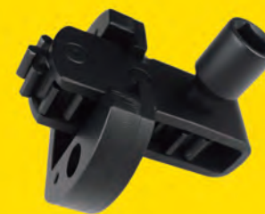
SK-9013J Engine Crank Alignment