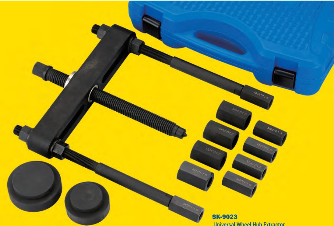
SK-9023 Universal Wheel Hub Extractor