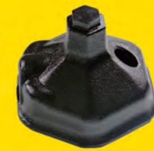
SK-9019A SAF Axle Nut Socket 140mm