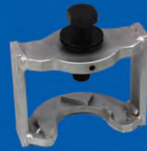
SK-9009G BPW Brake Linkage Adjuster Extractor