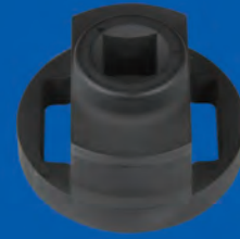
SK-9009N-1 BPW 6.5-9 Tons Roller Bearing Axle Nut Socket, 65mm