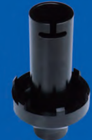
SK-9013C BENZ & MAN Rear Axle Nut Socket 80-95mm