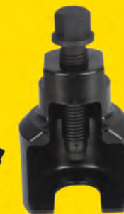
SK-9015-39 Ball Joint-Puller Bell Vibro-Impact 39mm