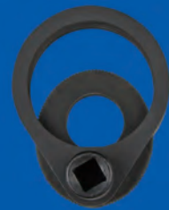
SK-7013-11 Heavy Duty Wreck Wrench Dia. From 25mm to 45mm