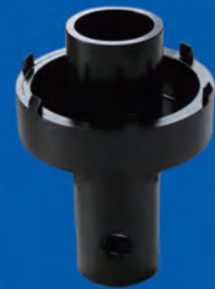
SK-9003B BENZ Rear Axle Nut Socket 105-125mm