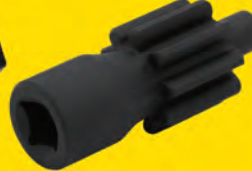
SK-9051B-1 Engine Crank Alignment DAF