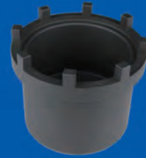
SK-9011Q SCANIA Front Wheel Nut Socket 80mm