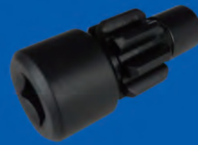
SK-9011M SCANIA Camshaft Rotator (1/2" Dr.)