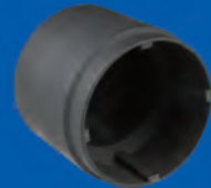
SK-9011I SCANIA Transmission Clutch Front Main Axle Nut Socket (3/4", 64mm)