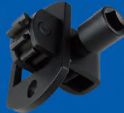
SK-9013I Engine Crank Alignment