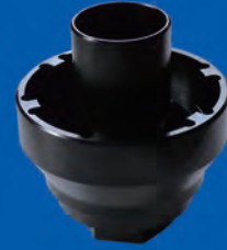
SK-9005B MAN TGA Drive Axle Nut Socket 133-145mm