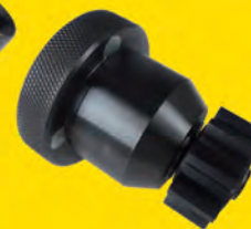
SK-9013M-1 Flywheel Rotating Tool with one Sprocket