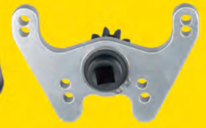
SK-9029F Engine Crank Alignment VOLVO