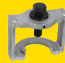
SK-9017A HALDEX Brake Linkage Adjuster Extractor